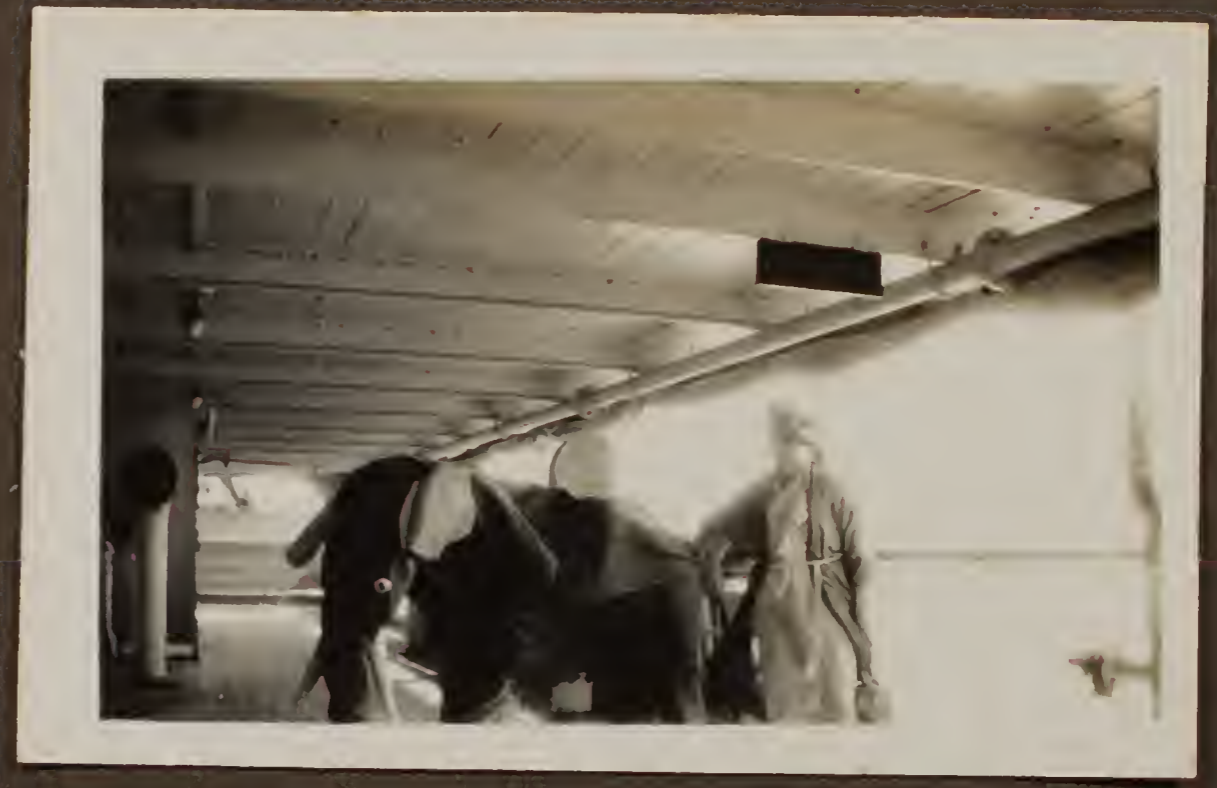
Measurement of Russell Elephant at 1st camp C.M.P. 11/14